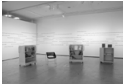
Figures 7.1, 7.2, 7.3 (opposite page) Mapping the Everyday: Neighbourhood Claims for the Future installation view, Audain Gallery, Vancouver, 2011–2012.