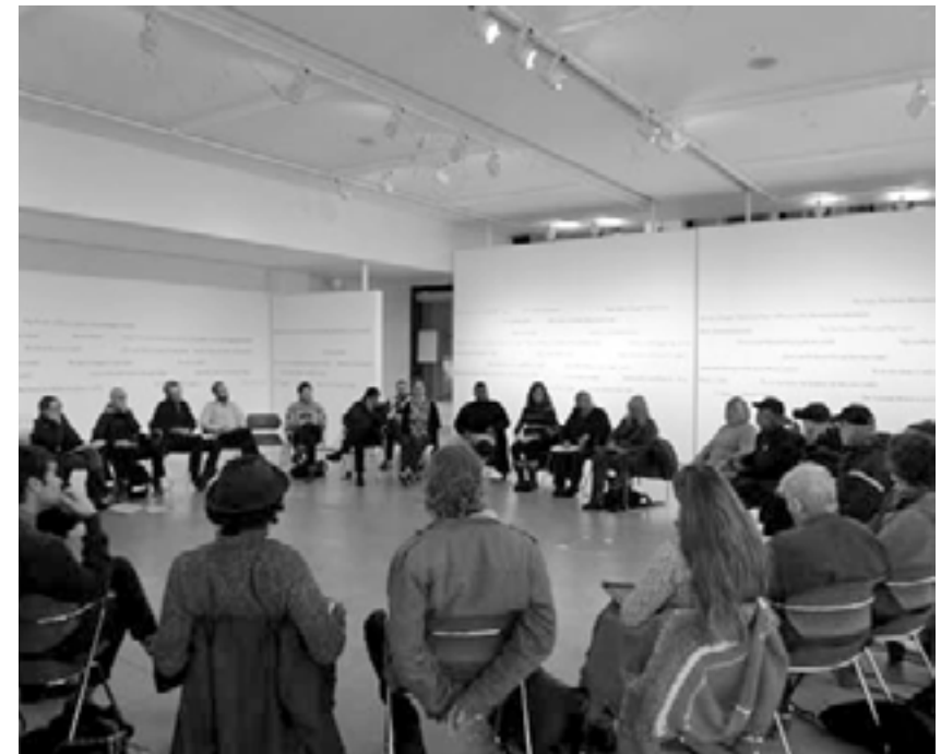
Figure 7.5 Collective Futures in the Downtown Eastside: forum and discussion led by the desmedia collective in Vancouver in the exhibition Mapping the Everyday: Neighbourhood Claims for the Future

recognition with regard to ethnic, economic, cultural, sexual, religious, or bodied differences. Differentiation and solidarity are therefore to be understood within the politics (and economics) that are their underlying structure. At the same time, this analytical understanding must not impede curatorial feminist agency and activist alliances. The contemporary feminist paradigm of transversal politics, as described by Nira Yuval-Davis, and of transnational feminism, as developed by Chandra Talpade Mohanty, offers not only a strong commitment to practice, at all times respectful of difference, but also a strong theorization of this very commitment. This allows us to conceive of the co-existence of differentiation and solidarity. Such a concept is foundational for the urban curatorial work of Mapping the Everyday: Neighbourhood Claims for the Future .